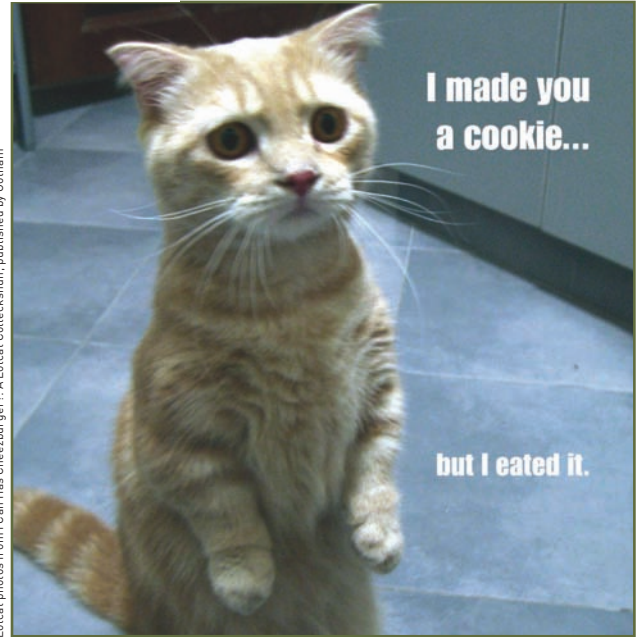
Lolcat photos from 'I Can Has Cheezburger?': A Lolcat Collectiskun, published by Gotham